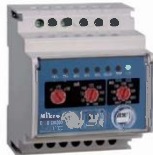
Earth Leakage Relay DIN300