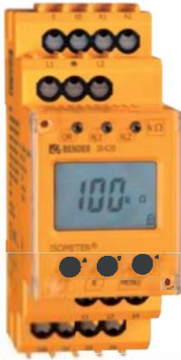
Insulation monitoring IR420