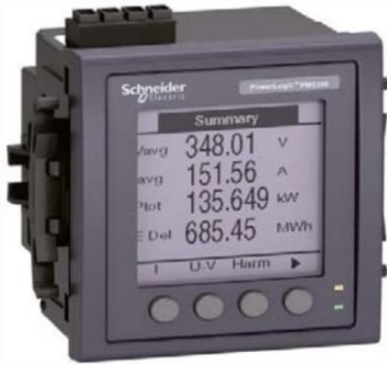
Digital Power Meter EasyLogic PM2200